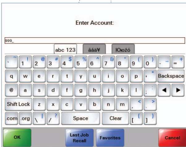
Search Screen - Full and partial alphanumeric search of complete client/matter list