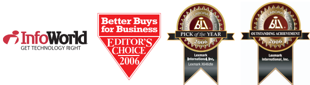
The Award-Winning Lexmark X646dte

Every day, Lexmark color and monochrome multifunction devices go to work for some of the world's most important companies. And their performance hasn't gone unnoticed.